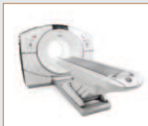
5 Ring PET - CT