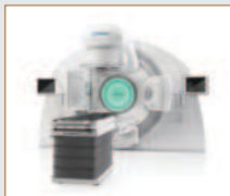
Elekta Linac Stereotactic Radiosurgery